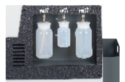
Ready for hybrid and electric vehicles Equipped with 2 fresh oil and 1 UV additive reservoir