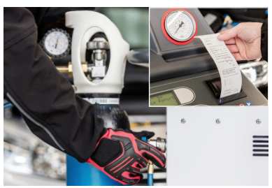
Nitrogen / Forming gas test clearly integrated in the software in compliance with the law