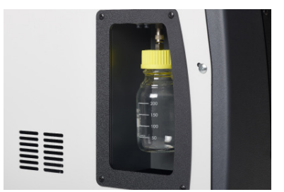
Intelligent ,Low-Emission' concept Innovative procedure for waste oil drain ensures the lowest refrigerant loss