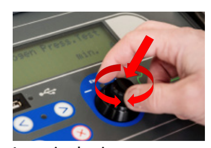
Innovative data input with CooliusSelect

Comfortable menu navigation and operation by navigation wheel