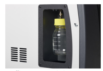
Intelligent ,Low-Emission' concept

Comfortable menu navigation and operation by navigation wheel