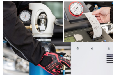
Nitrogen / Forming gas test clearly integrated in the software in compliance with the law