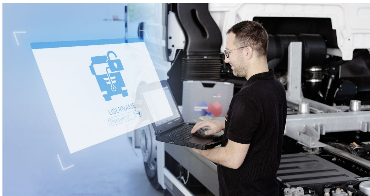
Caption "pic_01": WABCOWÜRTH Secure Gateway Portal: cross-brand vehicle diagnostics on encrypted commercial vehicles

As a renowned provider of vehicle diagnostics solutions, WABCOWÜRTH not only ensures that its products and services are manufacturer-compliant, but also that they are up to date and continue to develop. While users with a valid diagnostic licence enjoy the familiar clear and simple user interface of the W.EASY software design, the Secure Gateway Portal also opens up new possibilities for the future. As well as being easy to use, the administration is also extremely practical: With just one account, several users can be added and make use of the access conveniently at any time – with minimal dispersion of sensitive customer data.