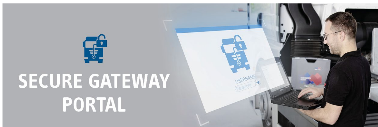
Caption "pic_02": On the safe side: OEM-compliant multi-brand diagnostics